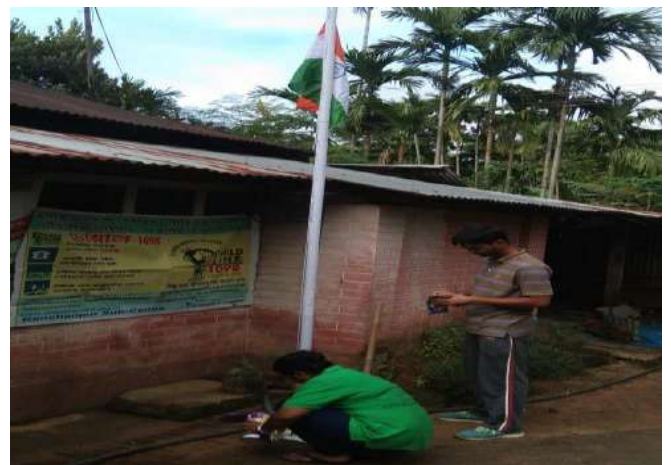
National Flag Hosting