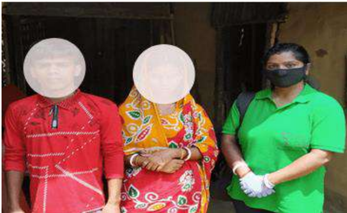
STOP CHILD MARRIAGE