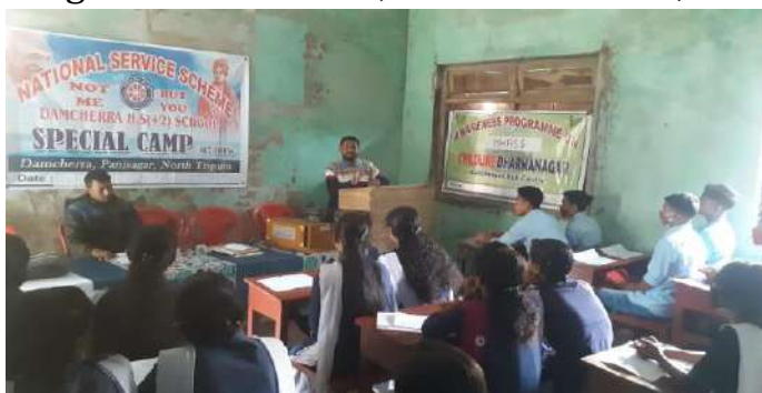
MHPSS program with School students at Dhamcherra H.S School

The Mental Health and Psychosocial Support (MHPSS) Network seeks to connect and support frontline workers, researchers and policy-makers in delivering and developing mental health and psychosocial support services for individuals and communities affected by crises across the globe. By promoting the sharing of practical advice and resources on both proven and promising interventions, the MHPSS Network will improve the effectiveness and sustainability of services provided to vulnerable people suffering the immediate and long-term social and mental health consequences of natural disaster, armed conflict, chronic poverty and devastating epidemics such as HIV/AIDS. Our child line team organized many program with Anganwadi Workers, Health Workers, Community people, school students & NGOs .