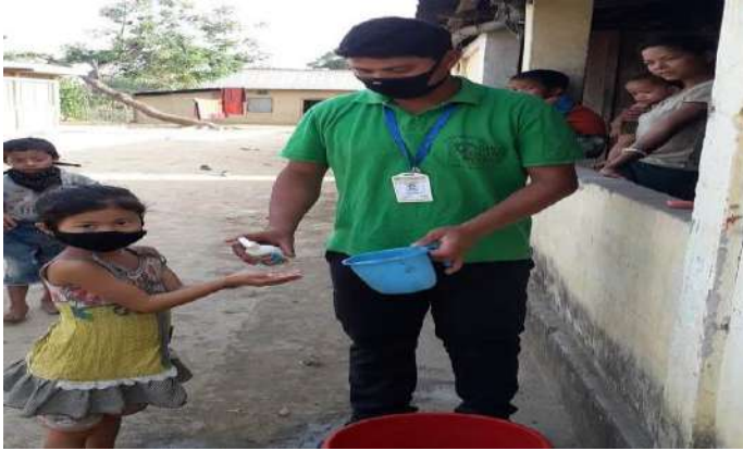
Outreach at Kanchanpur Bazar (Under Laljuri R.D Block)

Our first job is to conduct outreach regularly. Outreach means a kind of awareness program conducted verbally or using other methods such as providing Leaflets, doing Drama, Singing, Etc for the purpose of awareness. The team OUTREACH has been given by the CIF itself. Three types of outreach are there, Individual, Small groups, & Large groups.