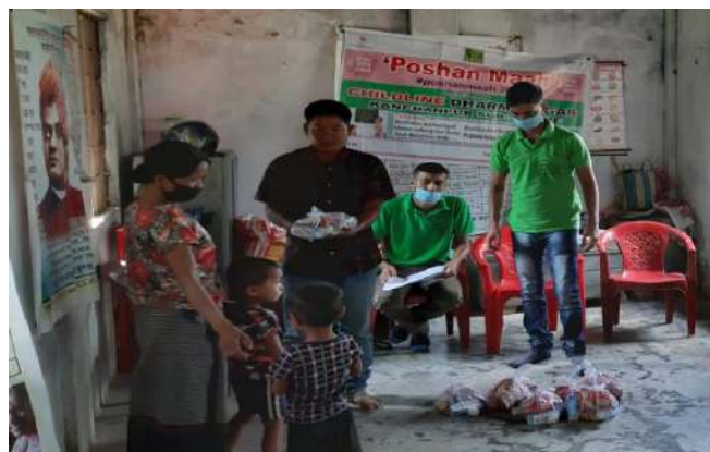
Nutrition food distributetion