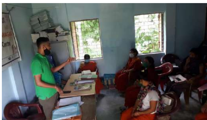
Meeting with AWW at Satnala Sector

14th November 2019 CHILDLINE Kanchanpur celebrates Children Day in a broader way. CHILDLINE celebrate this day as a CHILADLINE SE DOSTI DAY. It is a haul week celebration of various kinds of programs and activities. The centre of attraction of the program with govt. official and children. We let the students of Kanchanpur and Satnala H/S School to tie the Suraksha Band with the staffs of ICDS, PS, HEALTH, SCHOOL TEACHERS and others. We have organized friendly, jointly meeting with AWW. After the program, prizes were distributed among the winners of various competitions, and a Vehicle tour of the village putting CHILDLINE flex covering by.