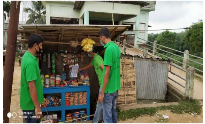
Outreach at Anganwadi Centre (Under Dasda R.D Block)