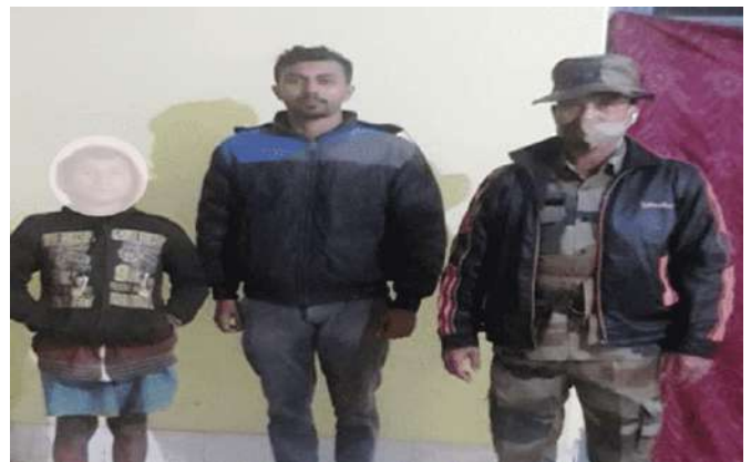
Rescue Missing Child