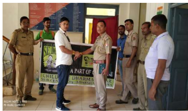
Wearing CHILD LINE Suraksha Band With Kanchanpur Police Station