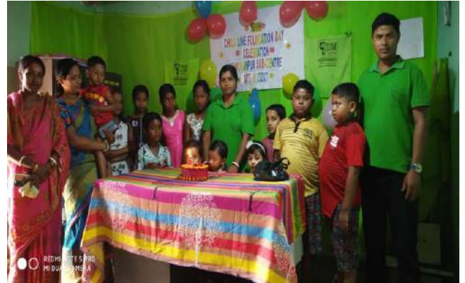
CHILD LINE Foundation Day Celebration photos