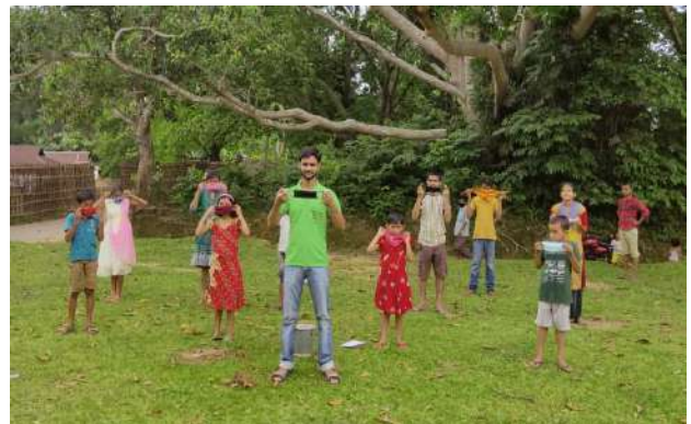
Open House At dasparapara AWC