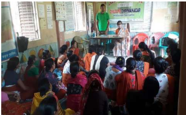
Open House At Chandrasingpara A.W.C

After conducting a series of Outreach at a particular area, we organize Open House program with the Children of that particular area. It's a Open platform for the children where they can describe their problem & issues. In addition, we try to solve every bit of it. We also raise the issues in CAB, to the DM. When we raise the issues in CHILDLINE ADVISORY BOARD meeting the issues use to be. Until now we have manage to conduct 12 nos. of open house at various place of Kanchanpur. Open House is open platform for the children where they can open up about the issues, which they could not share freely. We do organize Open house at various places at monthly basis. Moreover, try to get the issues to be raise by the children of that region, and after that, we do follow up those issues and try to sort out and find the solutions as well.