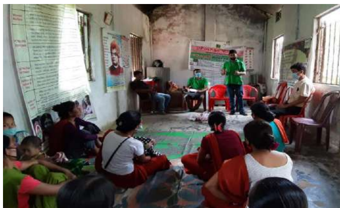
Awareness on Poshan Maah

Month of September 2020 was celebrated as Rashtriya POSHAN Maah. The activities in POSHAN Maah focussed on Social Behavioral Change and Communication (SBCC). The broad themes were antenatal care, optimal breastfeeding (early and exclusive), complementary feeding, anemia, growth monitoring, girls' - education, diet, right age of marriage, hygiene and sanitation, eating healthy - food fortification. Our Child Line Kanchanpur team distributes some nutrition food to pregnant mother & unhealthy child.