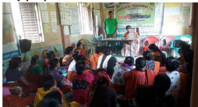
MHPSS program with Anganwadi & Health Workers At Satnala Village