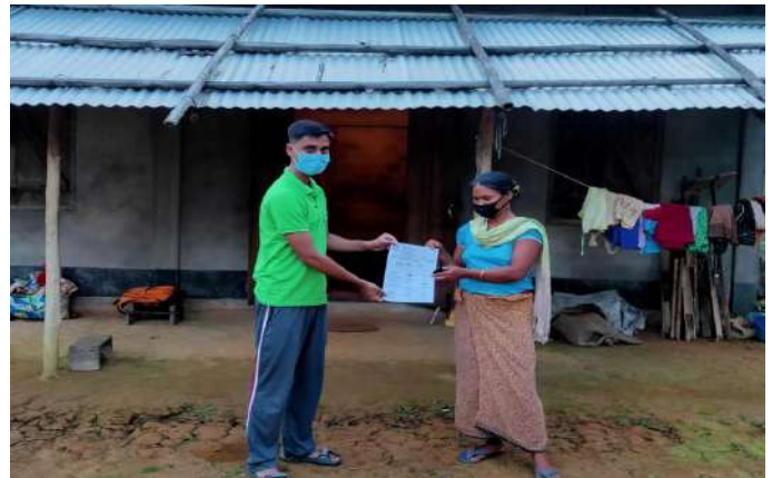
Covid 19 Awareness at Danghacherra AWC