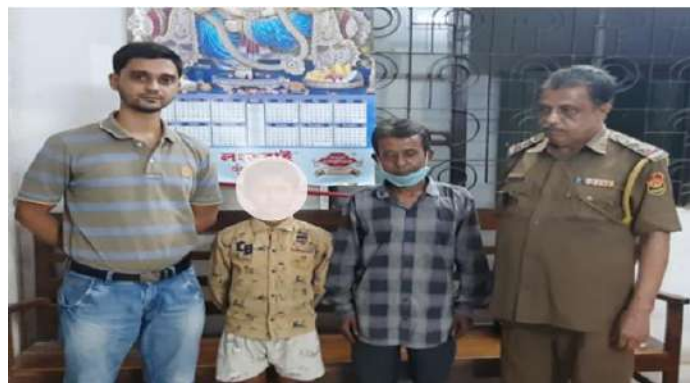
Missing Child Resque at Pacharthal